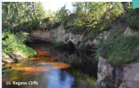
10. Raganu Cliffs

The trail begins near D. Ozoliņš Ape Primary School, 26 Pasta Street, Ape