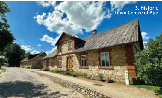
3. Historic Town Centre of Ape