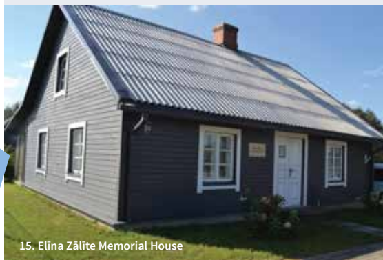
15. Elīna Zālīte Memorial House